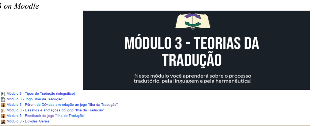
Figure 4 Module 3 on Moodle