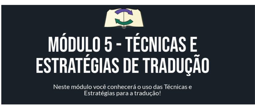
Figure 6 Module 5 on Moodle

Módulo 5 - Técnicas de Tradução (Infográfico) Módulo 5 - Reflexão sobre Técnicas de Tradução Módulo 5 - Lista Colaborativa de Técnicas de Tradução