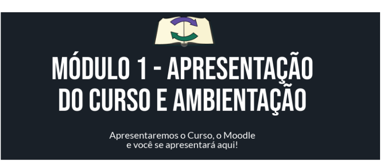
Figure 2 Module 1 on Moodle

I Módulo 1 - Orientações Iniciais Módulo 1 - Fórum de Apresentação Módulo 1 - Funcionamento do Curso e Cronograma Módulo 1 - Fórum de Avisos Módulo 1 - Dúvidas sobre o curso e sobre o Moodle Módulo 1 - Questionário