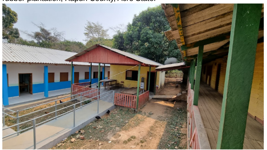
Image 9 Contrast between the new part of the school, and the old one, made of timber, in Floresta rubber plantation, Xapuri County, Acre State.