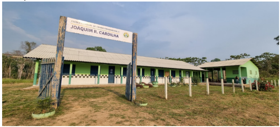
Image 8 New school made of masonry (standard) in Paraguaçu rubber plantations, Assis Brasil County, Acre State.

Yet, it is important highlighting that there are some schools, mainly those closer to urban zones, that are made of masonry, that have air conditioning, water supply, internet, and other facilities (Image 8). These schools are seen by teachers, students and managers as the standard set for the future, according to which, all schools must be just like the aforementioned ones (Image 9). These schools, which are closer to the cities, have many teachers who go from the city to the reservation, every day; they often take their motorbikes, but it also accounts for significant wear (Image 10). It mainly happens due to lack of a local state teachers' qualification policy).