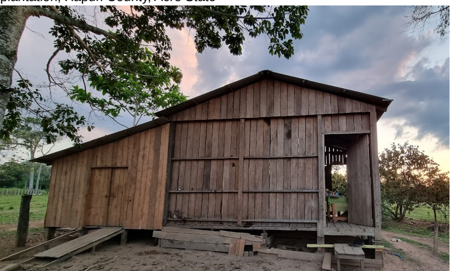
Image 3 Storehouse for rural production adjusted to a high school class, in São Pedro rubber plantation, Xapuri County, Acre State