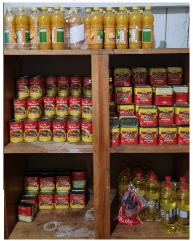
Image 7 Food items provided to the students, Xapuri County, Acre State.

Food provided to the students is often industrialized, and it comes from the city (Image 7); teachers coming from the city, in some cases along with their families, live in the school or in a family home close to it (they do not have good infrastructure or housing support — everything is improvised). Teachers often prepare children's food, and also clean the facility (there is no principal or any other employee) — in some cases, students are in charge of these activities. Teachers are also accountable for their own transportation to the city when they have to attend qualification meetings, to get their wage, to buy their food and hygiene items.