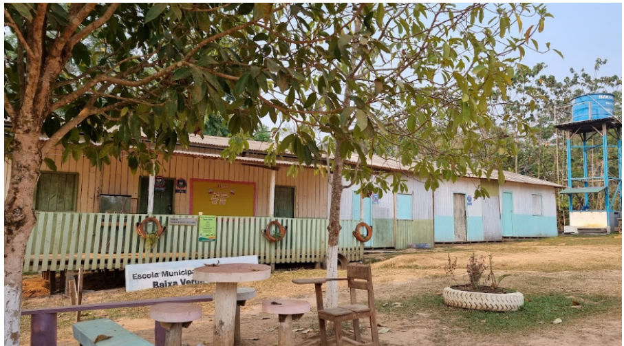
Image 11 Pole school, Icuriã rubber plantation, Assis Brasil County, Acre State.

Besides the small schools in the communities, there are also some pole schools in some regions; they receive students from closer communities. It happens when transportation logistics is made on dirt roads, because it allows the school to support many communities, since they can be reached by school buses – these schools often have a better infrastructure (Image 11). Briefly, in all cases, all aspects seem precarious to us.