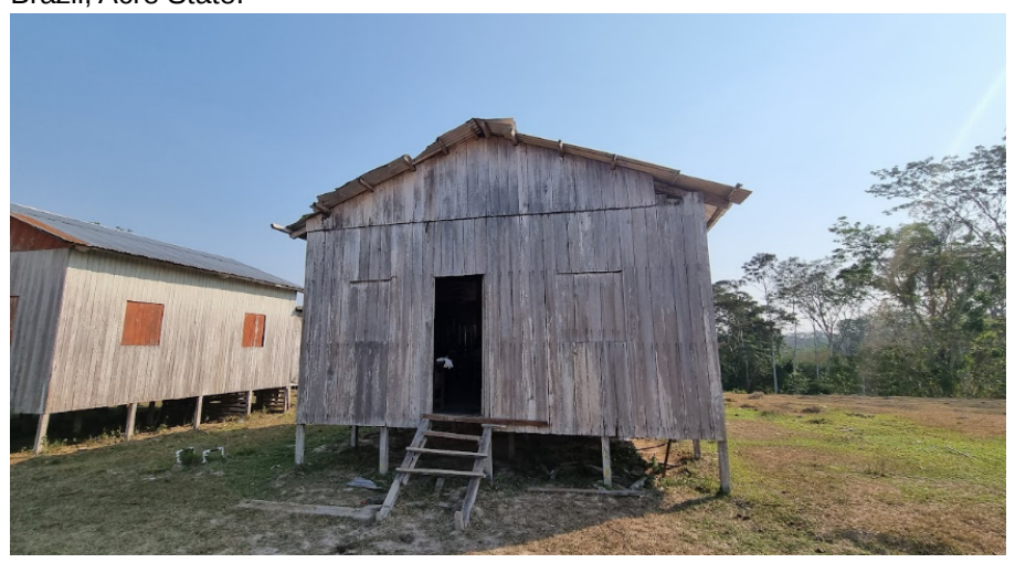
Image 2Old residence adjusted to house a high school class at Icuriã rubber plantation, in Assis Brazil, Acre State.

We can say that only basic school got to Acre State. Sometimes, it was improvised in empty houses (Image 2), in porches, in storerooms (Image 3), in rooms in the association, as well as in other locations. Oftentimes, schools in these communities only had one classroom, the kitchen and, sometimes, a restroom, all made of wood (Image 4).