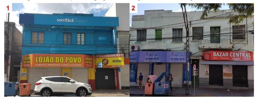
Figure 7: Buildings No 1 and No 2 presenting significant changes due to advertising activities.