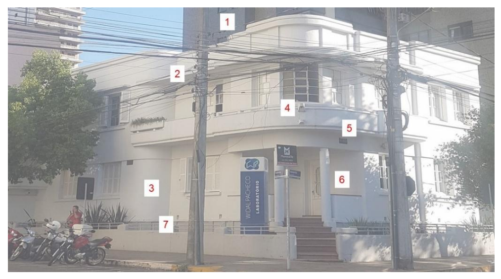
Figure 3: An Art Deco building in Passo Fundo with features demonstrating streamline moderne references, which are: cornice, marquee, curved wall and balcony (numbers 1, 2, 3 and 5); columns and flagpole support (numbers 6 and 4); and railings with circular iron profiles (number 7). It may be noted that, in this case, all the circular elements of the house, added to the columns and the mast, help to demarcate the corner.