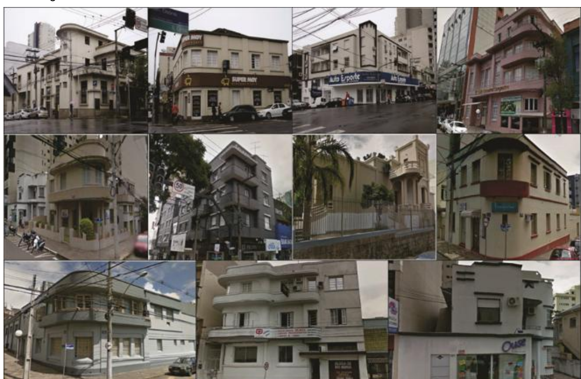
Figure 10: A collection of 11 examples of Art Deco that presented fewer identity problems arising from the practice of advertising and/or its state of conservation.

Observed from another angle, some good examples were also identified of advertising and preservation amongst the identified Art Deco buildings. More precisely, 11 buildings (approximately 26.2% of the total) are in good condition and, in the case of commercial or service buildings, have signs and advertisements in sizes and colors that do not hinder the perception of the original architectural elements and may serve as an example in the city of Passo Fundo (Figure 10).