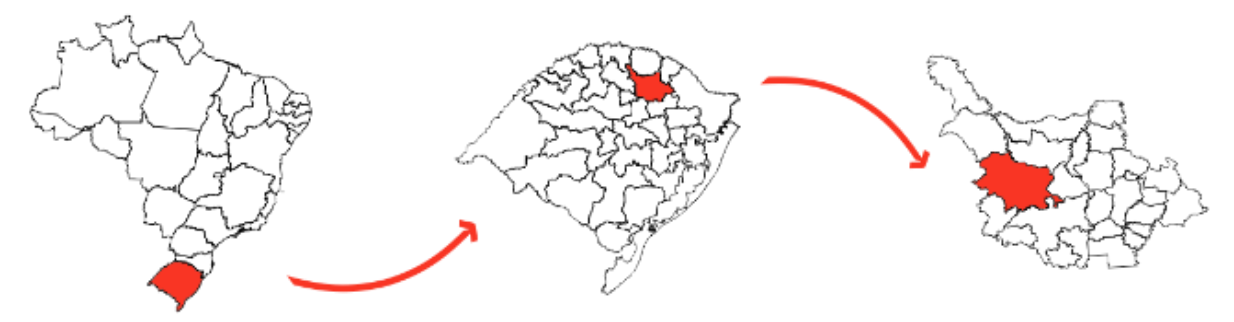
Figure 4: Map showing where Passo Fundo is located, in the northwest corner of the state of Rio Grande do Sul.

The population of the municipality of Passo Fundo is approximately 200 thousand (IBGE, 2010), and is characterized as a medium-sized city due to the types of horizontal and vertical relations that it presents with nearby municipalities and other Brazilian states (FERRETTO, 2012). Agribusiness and the food industry form an agro-industrial complex in the city, responsible for most of the established vertical relationships. Health, education and commerce services, on the other hand, are the main vectors of attraction for the population from several cities around Northwestern Rio Grande do Sul, thereby establishing horizontal relations (Figure 4).