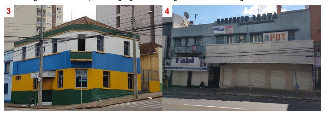
Figure 8: Buildings No 2 and No 3 presenting significant changes due to advertising activities.