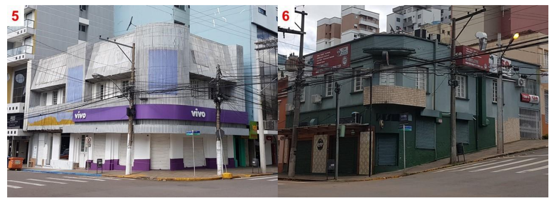
Figure 9: Buildings No 5 and No 6 presenting significant changes due to advertising activities.