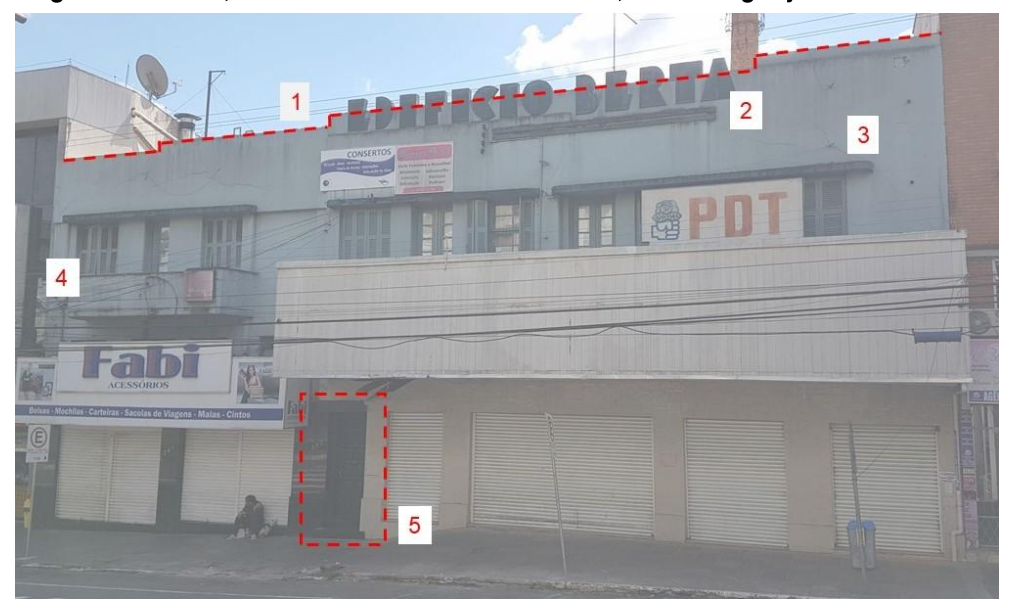
Figure 2: An Art Deco building in Passo Fundo with features demonstrating zigzag moderne references, which are: 1 - straight and staggered cornices; 2 - linear friezes; 3 - straight marquees; 4 - straight, simple volumes along the balconies; and 5 - a centralized main access, even if slightly shifted to the left.