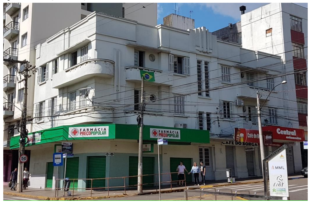
Figure 5: The Lângaro Building today (2020).

The first example of Art Deco built in Passo Fundo was the Lângaro Building (Figure 5), which dates from 1942, and is located on the corner of Brasil Avenue and General Neto Avenue, in the central region of the city. The building was designed by the engineer Annito Petry and also represents the first residential apartment building in the city (GOSCH, 2002). Thus, it may be stated that the Lângaro Building marked the beginning of the verticalization process in the central area of Passo Fundo. Past surveys have revealed that Passo Fundo had more than 200 Art Deco buildings in the decades between 1940 and 1960 (LORENZI, GONÇALVES and PICCINATO, 2018).