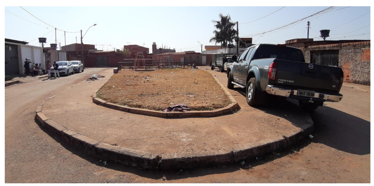
Figure 2: General View of Square (Action area)